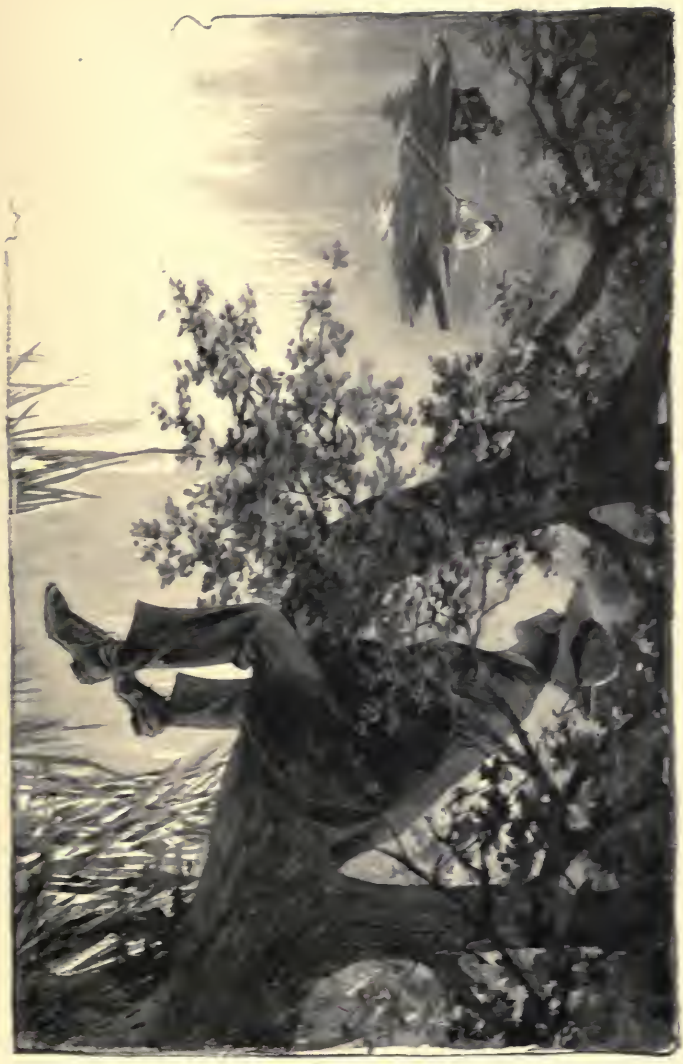
"PRUDY 'BEN TALKING ABOUT MR. 'TIC MUTTONED."